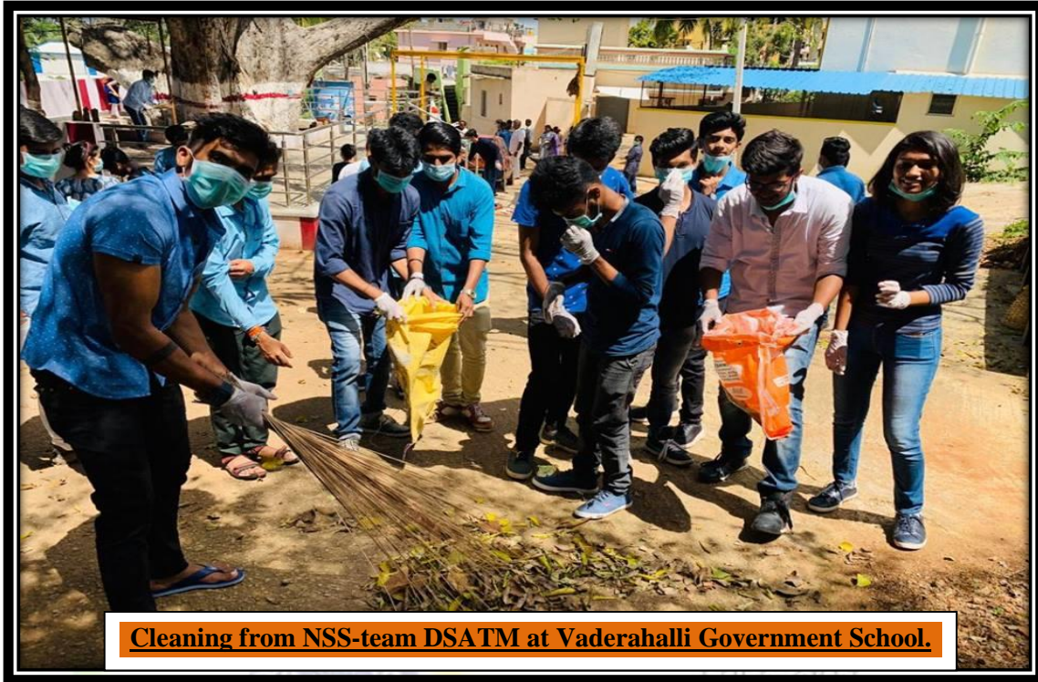
Cleaning from NSS-team DSATM at Vaderahalli Government School.