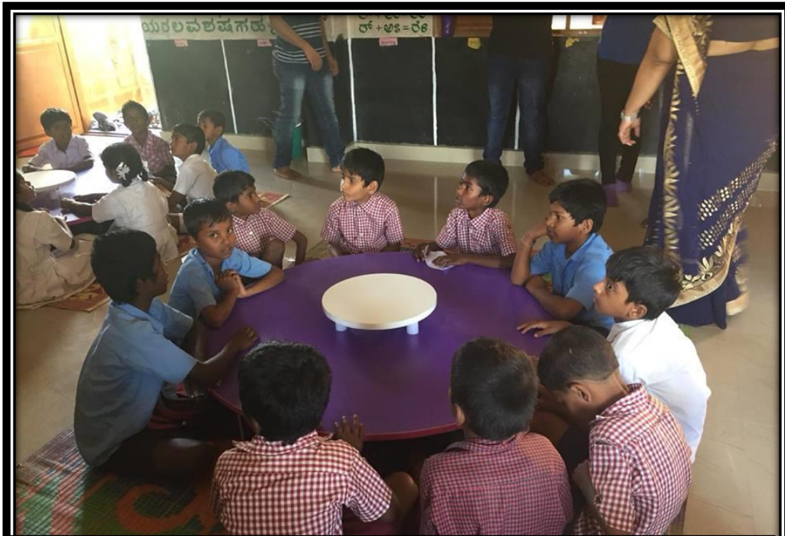
Study tables provided for children of Agara Government School.