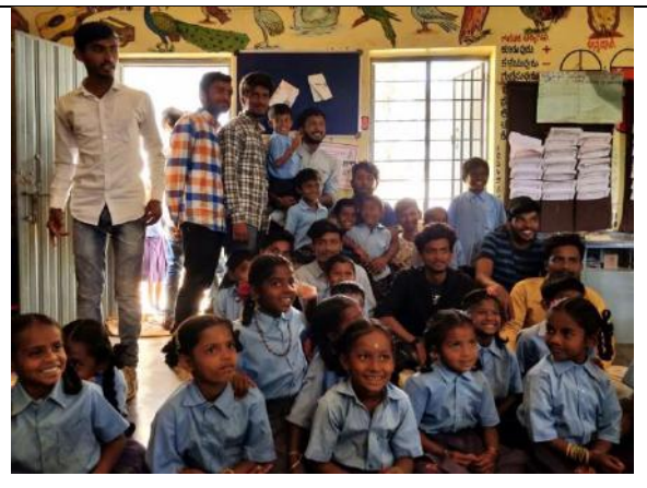
Civil Engineering Students Interacting with the School Kids.