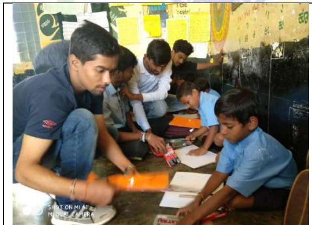
Civil Engineering Students Assisting School Kids in the Drawing Activity.