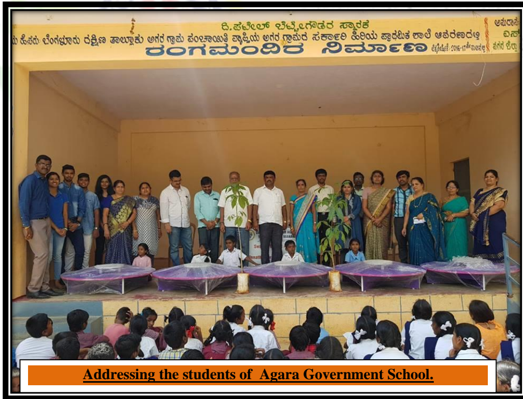
Addressing the students of Agara Government School.