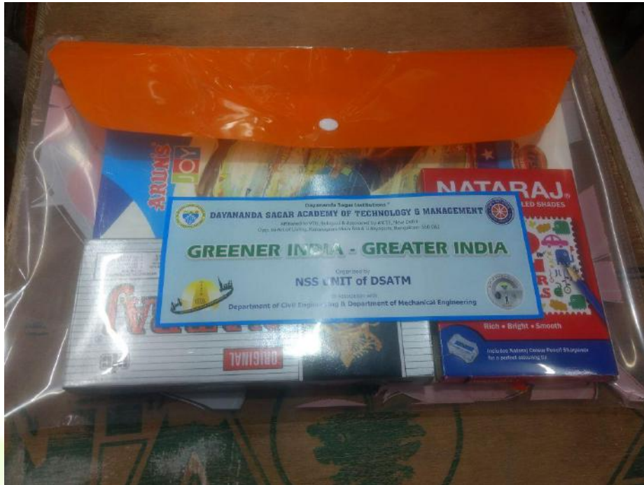
Photograph of the Basic Educational Kit Consisting of Construction Box, Coloring Pencils, Note Books, and an One Sided Books to Document the Good Deeds the Students Do Every Day.