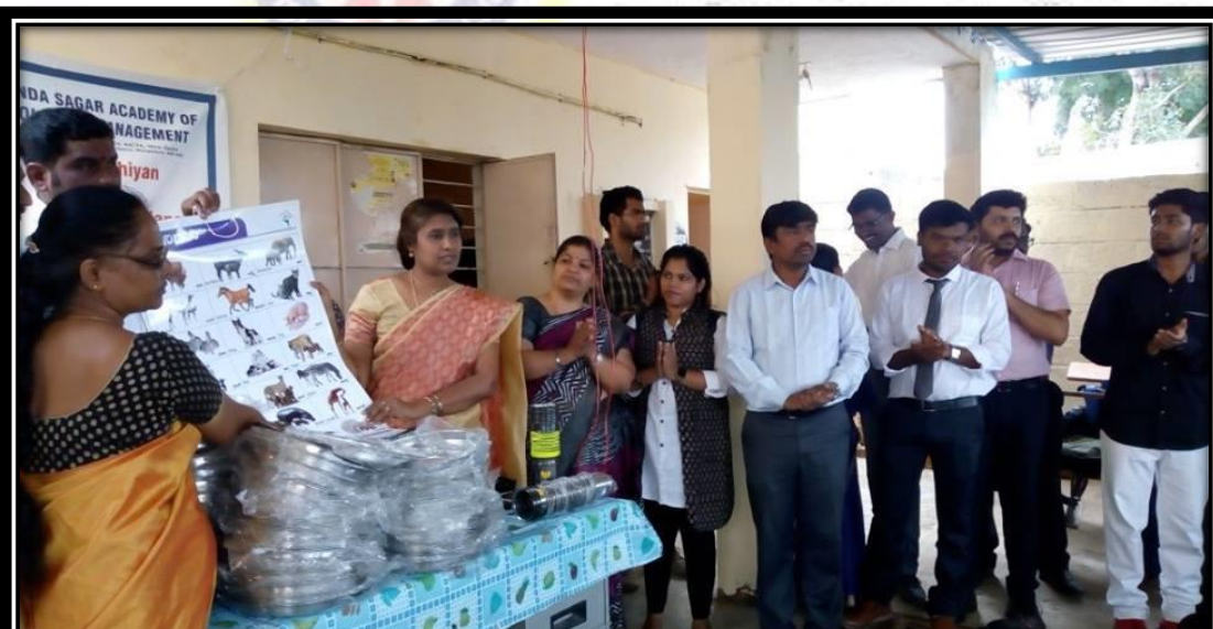
Display charts, Plates for meals are provided to Vaderahalli Government School.