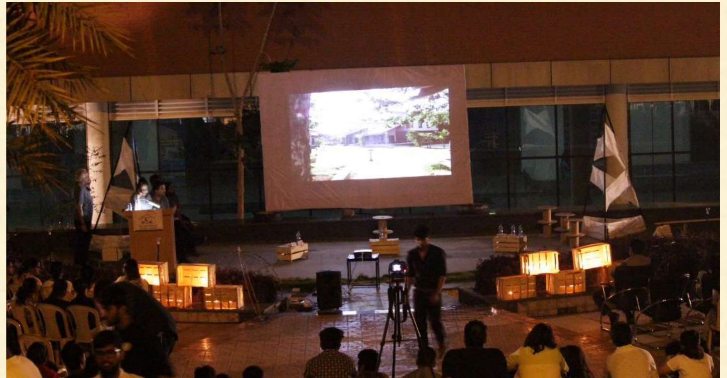
Candle Lit OAT